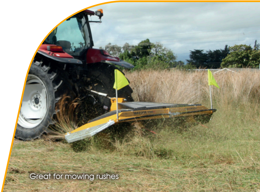
Great for mowing rushes

The long skids under the cutting drums eliminate scalping and the mower's clean cut ensures quick regrowth. With the Maxam Mower the anticipated strips left by running the tractor wheels over the uncut crop are eliminated in most mowing conditions. This is due to blade speed, wheel positioning and generating an updraft under the rotor.