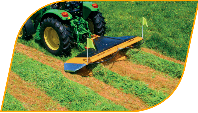
Mow into rows for silage or precutting for cows