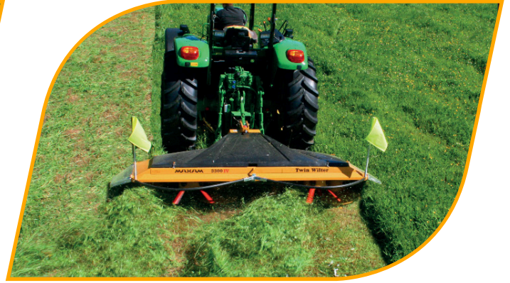
A full spread of conditioned grass for quick wilting